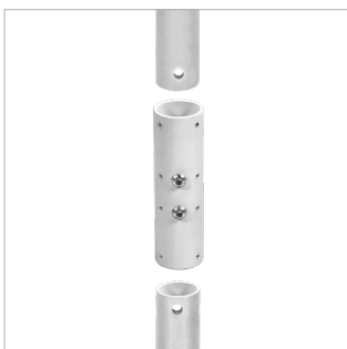
Attaches directly to BT5935 ø38mm poles