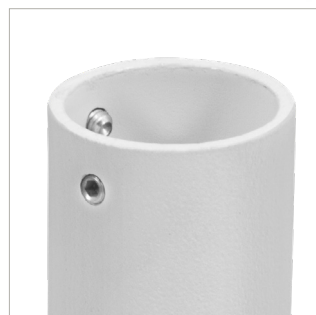
4mm heavy duty steel capable of supporting substantial loads