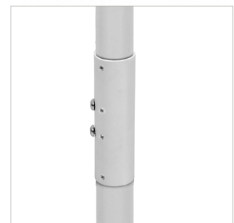
Allows a rigid external join of 2x BT5935 poles to extend the drop of System V installations