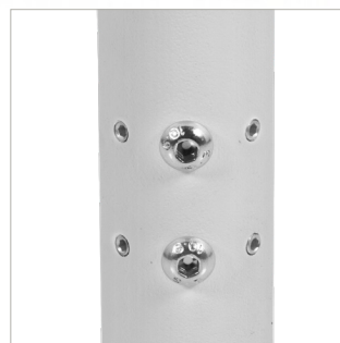
Safety bolt holes ensure a secure connection to System V poles