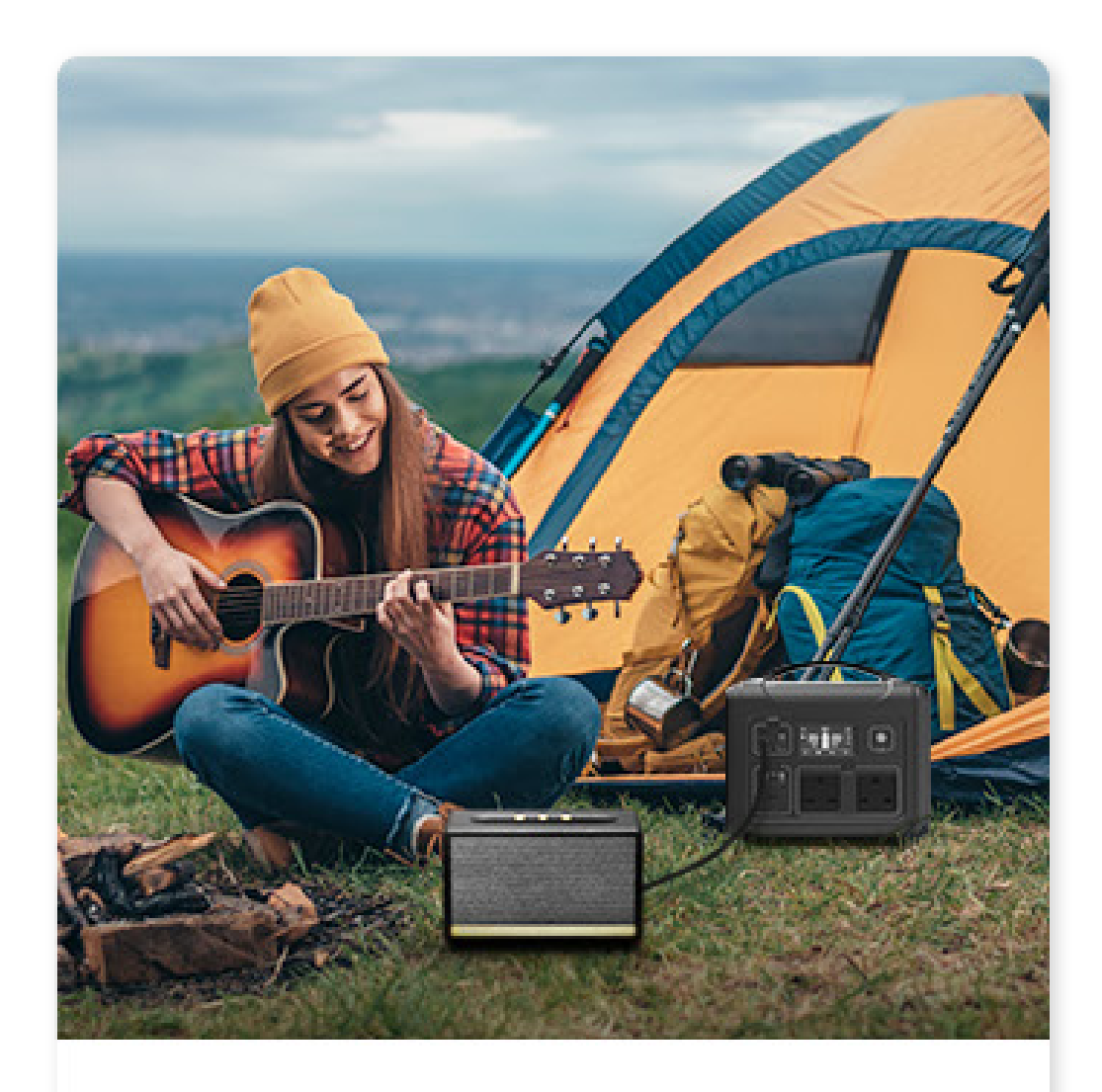
Plan road trips with enough power