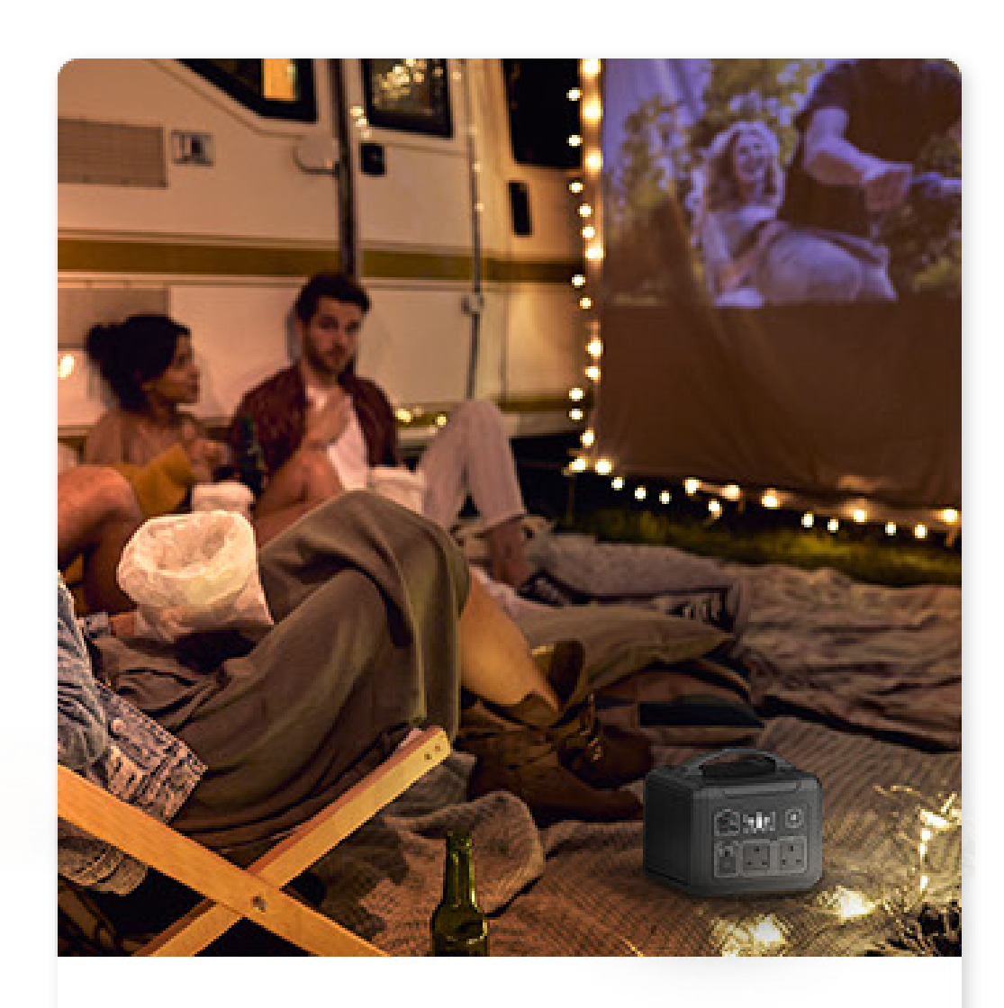
Enjoy the outdoors just like home