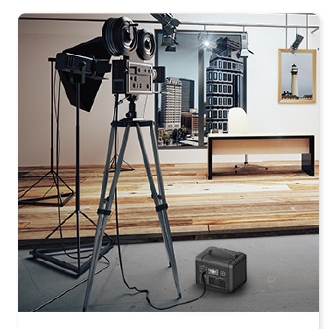
Power your creative filming projects