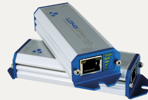
Smart LED display shows SAFEVIEW™ technology.

separate POE injector may be used as the Base power source. Maximum power and range is achieved with the optional 57V Veracity PSU, enabling the LONGSPAN Base unit to become the POE injector for the link.