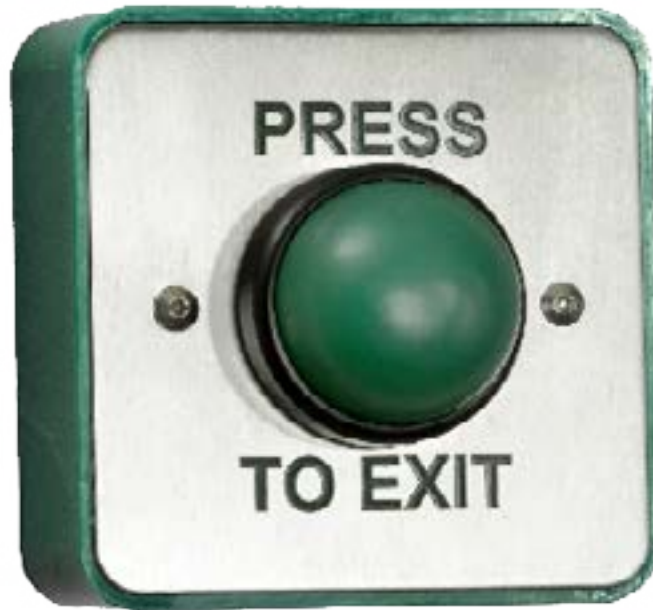
Request to Exit Button