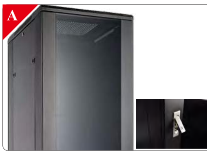
The tempered lockable glass door .