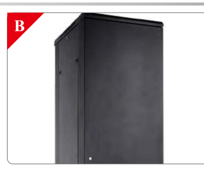
Lockable Rear Door.