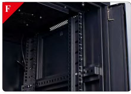
Front and rear sets of vertical rails adjust in quarter inch increments. Simply unscrew the rails, adjust them to the required depth and refasten.