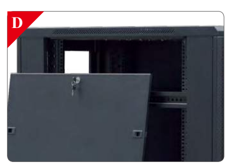
Lockable and removable side panels.