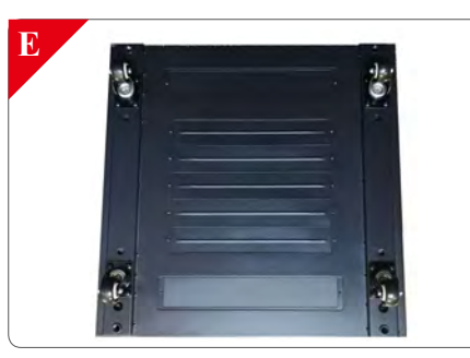
Base cable entry