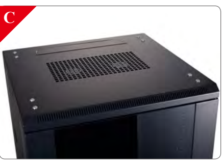
Optional Fan tray(2 fans for 600mm,4 fans for 800mm or 1000mm deep rack) allow air flow in the cabinet.